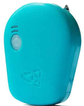
Not the actual size, it is half the size...

The Smartphone users are required to have their Bluetooth and Location Services switched on, which more than the majority do.